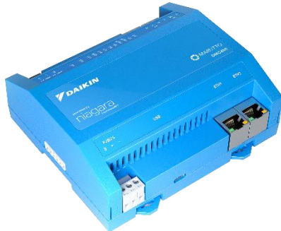
DMC400A8G-N4 Core network controller & server

Introducing the new DMC400 series of all-in-one controllers and network management engines. The DMC400 series devices seamlessly integrate with the DMT IO module family and other 3 rd party devices and systems. The DMC series controllers enable unparalleled compatibility to enhance your control infrastructure. Powered by Niagara Framework, the DMC400 series device range empowers your network with advanced integration and control capabilities.